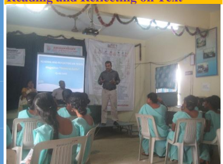
Reflective discussion on the news and journals items (formal setting)

The innovative 2 Year B.Ed., curriculum includes "Reading and Reflecting on Texts" as one of the courses on Enhancing Professional Competencies (EPC). In order to transact in Formal and Informal settings. The individual and group reading reflections are practiced by bringing the text materials.