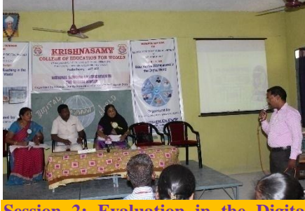
Session 2: Evaluation in the Digital