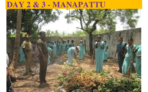
Temple Cleaning monitor by Sub-Inspector