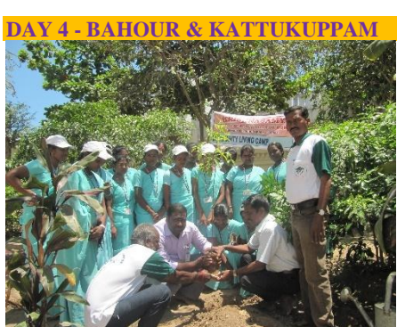
Planting trees – Bahour Temple.