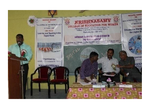
Session 4: Financial Management in the Digital World