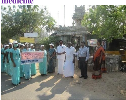
Awareness Rally & Cleaning work -Manapattu Village