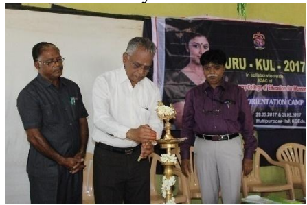
Inaugural - Lightening the kuthuvilakku

Two days in- service orientation programme for teachers in Krishnasamy College of Education for Women and school teachers. The programme was named as "Guru – Kul 2017" organized in the college from 29th& 30th May 2017.