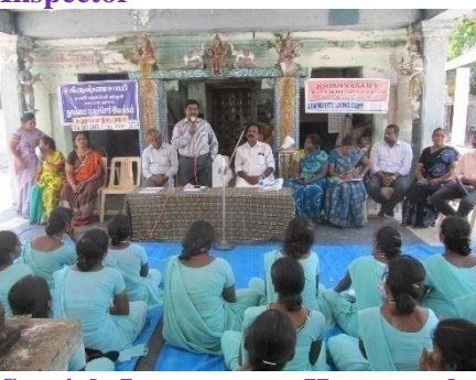
Special Lecture on Homeopathy medicine