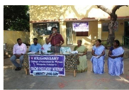
Special Lecture on Human Values - Govt. School, Kattukuppam