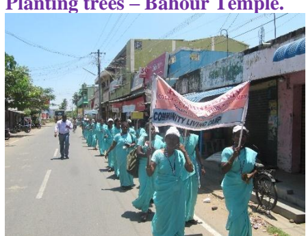
Awareness Rally at Bahour