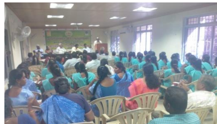
Visit to Pondicherry Institute of Linguistics and Culture, Lawspet on 17 th December 2015.