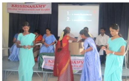
Counting of Votes

Pedagogy- wise representative election was conducted on 10 th November 2015 and five members were elected. They elected their Chairman, Secretary and Joint-Secretary.