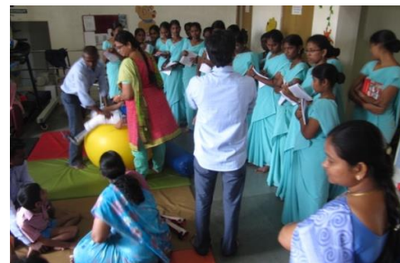
Activities for the Special Children in Sathiya Special School, Karuvadikuppam on 5 th & 6 th Jan 2016.