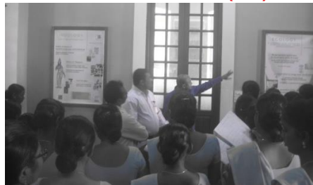
A faculty members of the Institute of French Puducherry were explaining the course structure and their programs to the student-teachers on 7 th Jan 2016.