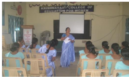
Special programme on AIDS Awareness.

Man is a living organism. So he should know how to avoid the diseases and moreover AIDS is a disease which kills the human beings gradually. So to create awareness, a special program on “AIDS Awareness” was conducted on 1 st Dec 2015.