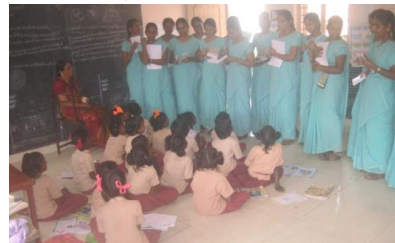
Visit to the Government Service Home and student-teachers interaction with the school children on 18 th Dec 2015.