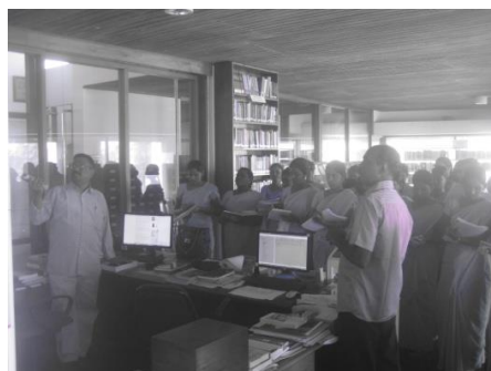
A library faculty of IFP explained the working of E-Library Forms & Procedure to the Student-Teachers.