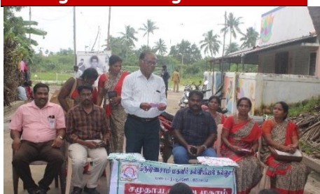
05.12.2018, A Special Lecture on 'Organic Farming'