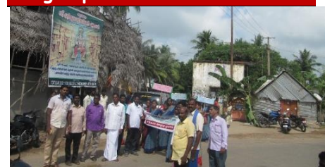
06.12.2018 Awareness Rally - Dengue protection - Sarkasimedu

One of the village Heads inaugurated the Dengue Protection Awareness Rally at Sarkasimedu village.