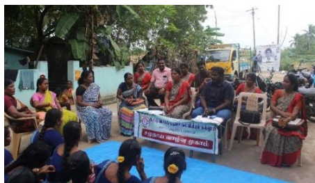
06.12.2018, Awareness Rally - Dengue Protection - Pinnachikuppam