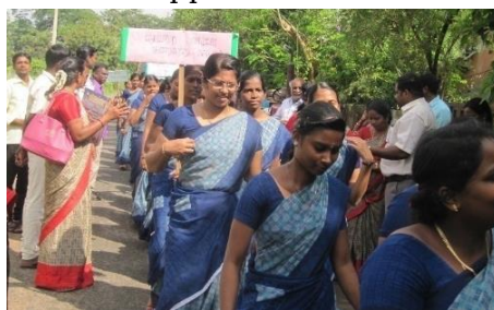
06.12.2018, Tree plantation & Cleaning work at Pinnachikuppam

The third day community living camp was organized at Pinnachikuppam and Sarkasimedu villages. One of the village Heads inaugurated the Dengue Protection Awareness Rally at Pinnachikuppam