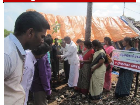
06.12.2018, Tree plantation & Cleaning work at Sarkasimedu

One of the village heads planted a sapling at Sarkasimedu village.