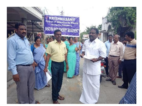
Shresth Swachhata (Iconic Places) – Inauguration by DANAVELU.N MLA of BAHOUR Puducherry